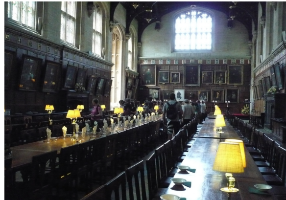
The dining hall at Christ Church College was used as Hogwarts’ dining hall in the Harry Potter films.

Christ Church is not the only famous college in the town. Oxford consists of