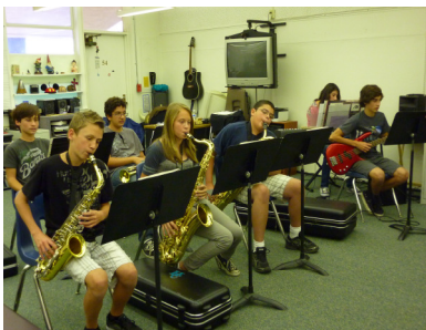
The Jazz Band practices for their next performance.